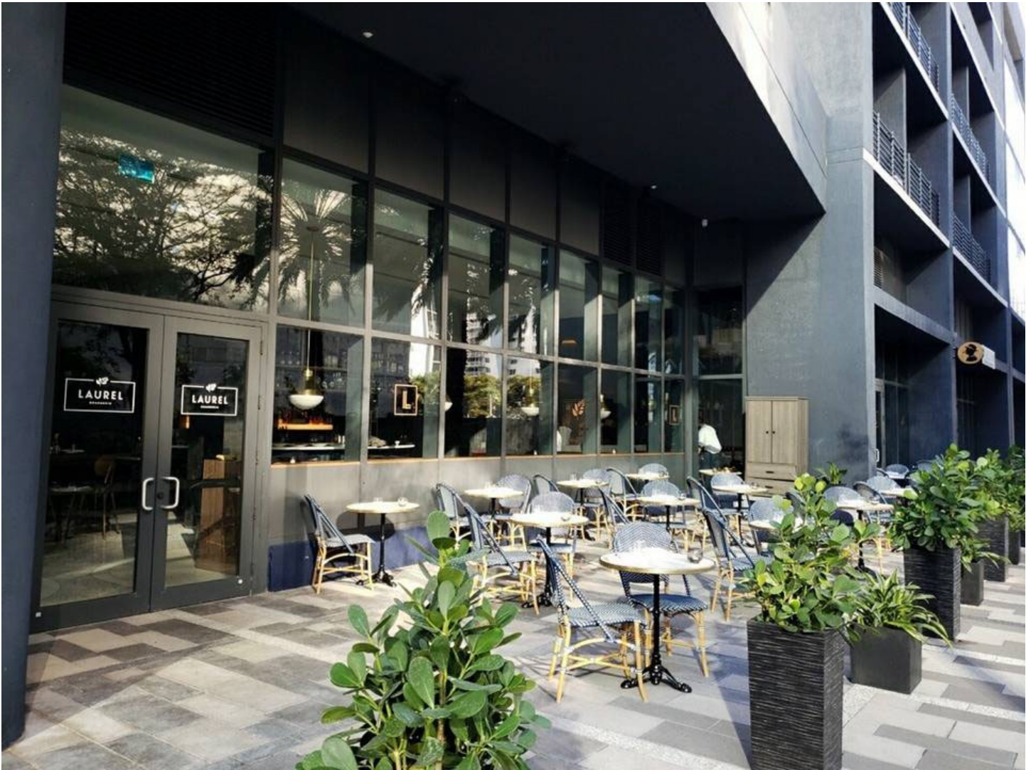
The French restaurant Brasserie Laurel, pictured above, was among the first eateries to open at Miami Worldcenter.