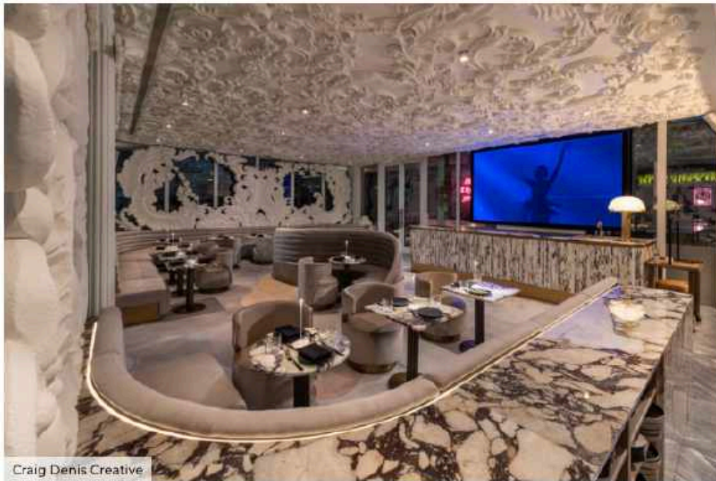
Craig Denis Creative

If you think that's all, think again. Step in to the restaurant's so-called "crown jewel," the awe-striking Dream Room. It's a main dining room engulfed with French lace and elaborate baroque detailing, while the walls and ceilings are ornamented in 3D wood-carved architectural detailings.